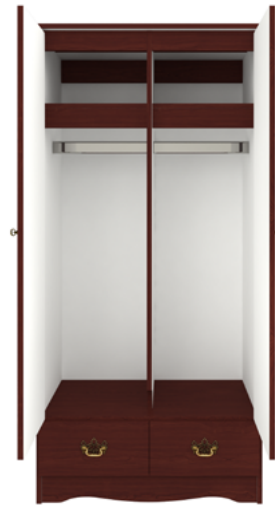
Model: BEALZ 34.5W 23.75D 71H

Kwalu's Beaufort Dementia/Alzheimers Wardrobes are thoughtfully designed to support resident independence and safety. Hidden door latches and passive locks allow caregivers exclusive access. Light colored interiors help with spatial orientation. The interiors feature a lighter color finish to increase visibility of the contents. The product is required to be wall mounted for safety. Using the kit provided, please follow provided instructions exactly.